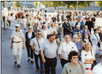
... and proceed to the Grotto