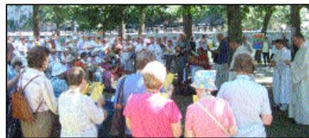
Pilgrims at 'The Water Service'