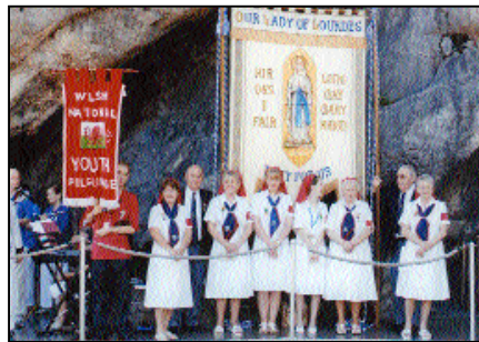
Brancardiers, Handmaids and Youth at the Grotto with their pilgrimage banners