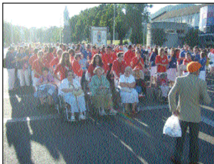
Pilgrims assemble at 'The Crowned Virgin'