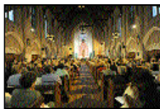
above - the packed cathedral