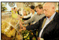
above and right - the veneration of the Relics

The cathedral was closed to the public at midnight but was open again from 7.00am on the Wednesday with the 'Office of readings', 'Morning Prayer of the Church' before the mid-day 'Mass for Evangelisation' and finally the 'Solemn Liturgy for the departure of the Relics' at 1.00pm.