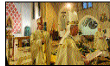
above - the Bishops of the three Welsh diocese

The cathedral was open for the veneration until midnight, during which took